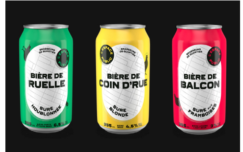
Design: Écorce | Location: Montreal