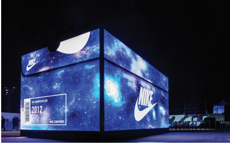
Design: Hybrid Design | Location: San Francisco