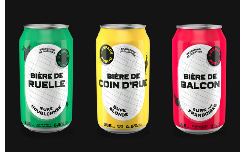
Design: Écorce | Location: Montreal